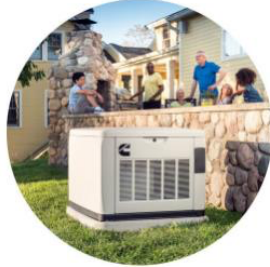
Home and Recreation